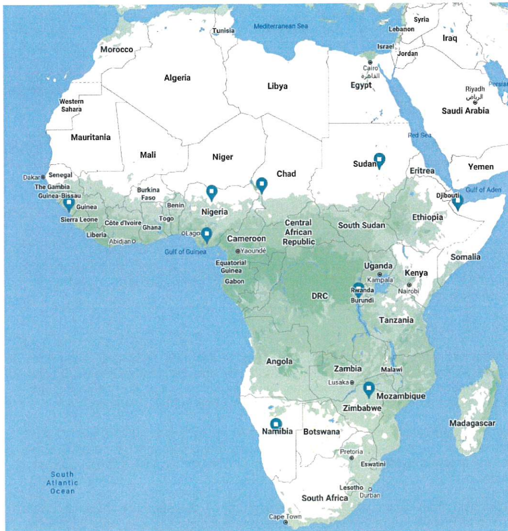
Figure 1 SAFE Africa funded courses

Since the start of the campaign, SAFE Africa funding has been awarded to nine projects, shown in Figure 1, totalling £59,900.